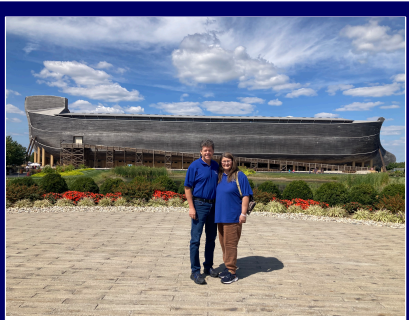
Went with "The Liberty Lights" from Liberty Church of Christ to see "The Ark Encounter"

What seems to be the overall objective of a Liberty Lights Trip?